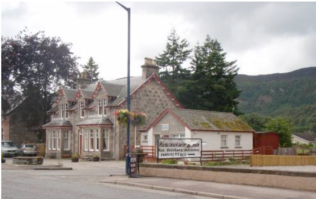
Fig. 2 : The Shelter Stone and bothy, with the proposed site located to the rear