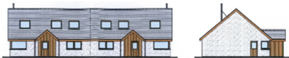
Fig. 5 : Currently proposed semi detached dwelling houses