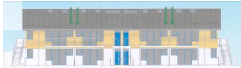
Fig. 8 : Proposed elevations 08/206/CP