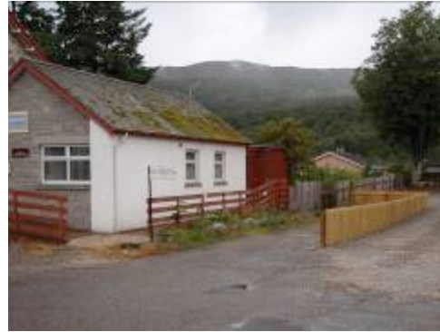
Fig. 4 : Demarcated vehicular access to the proposed site.