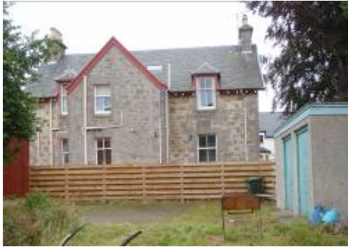
Fig. 3 : Sub division of rear garden