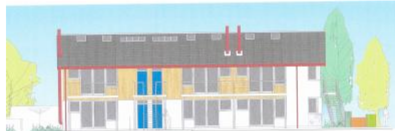
Fig.9 : Proposed elevations 08/406/CP