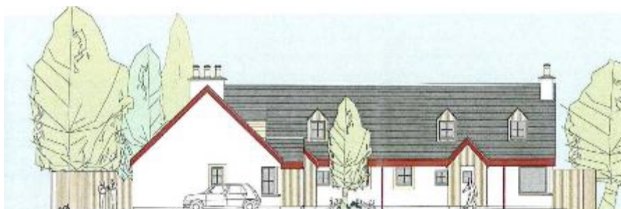
Fig. 10 : Previously proposed design