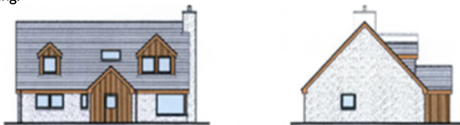
Fig. 6 : Currently proposed detached dwelling house